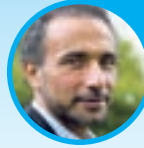
Prof. Tariq Ramadan OXFORD UNIVERSITY

"This is a crucial opportunity for you to potentially shape the political reality for the next few years – make sure you make your mark!"