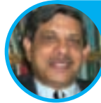
Prof. Humayun Ansari ROYAL HOLLOWAY, UNIVERSITY OF LONDON

It is important to increase the ratio of good parliamentarians who support just causes and lead by example".